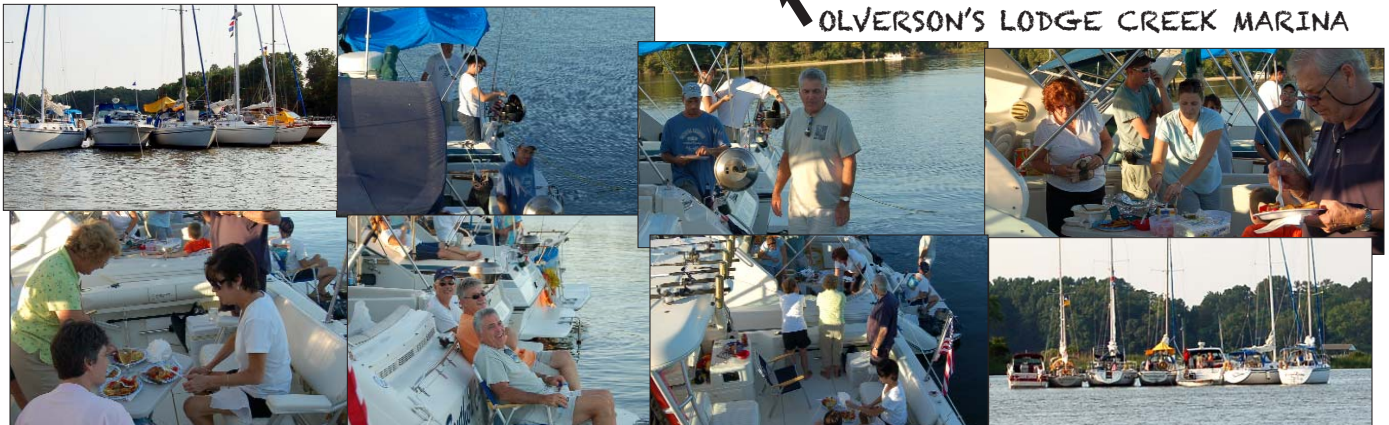
OLVERSON'S LODGE CREEK MARINA

A "close to home" mini-cruise that should bring a day (or two) of fun at the "Beach", where you can party, swim, build sand castles or whatever. Larger boats will raft-up just south of the Beach area and smaller vessels can go back and forth to the raft-up tying along side. Your choice to either stay over night or return to Olverson's